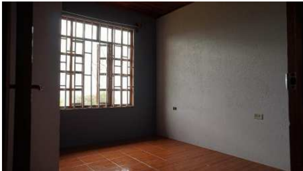
Room III approx. 9 m 2