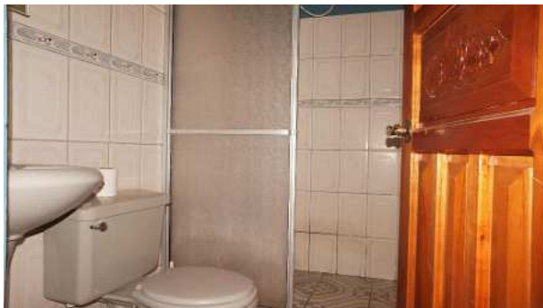
Shower bath I