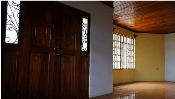
Entrance /living area approx. 27 m 2