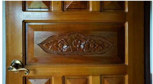
Solid wood doors