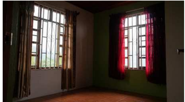
Room III approx. 9,6 m 2